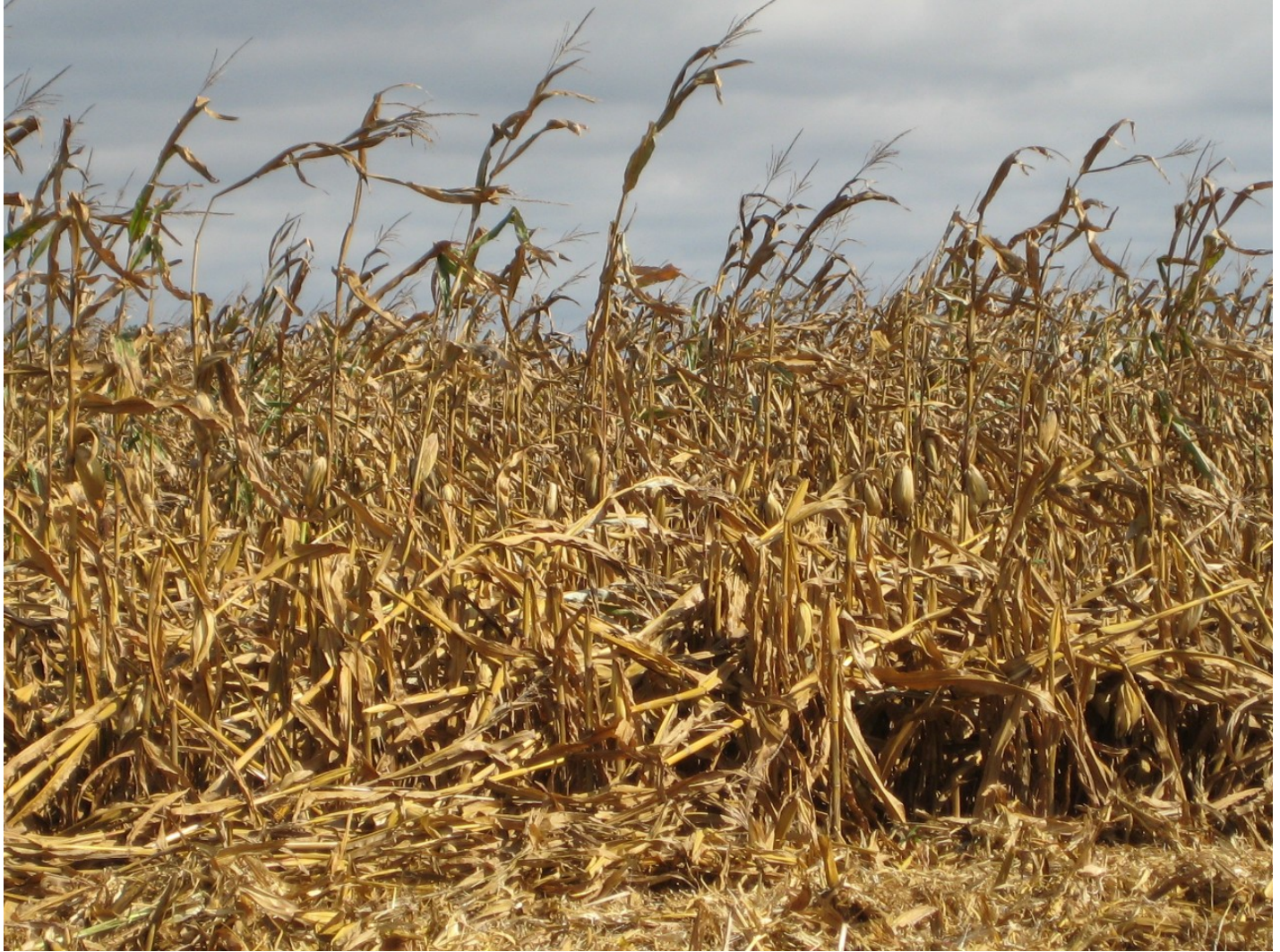
Figure 3. Fields with severe tar spot infection may result in stalk lodging.

In some areas where tar spot has occurred, there are many fields that will likely see little to no yield loss because the disease came in later in the season or symptoms did not develop to levels that impact yield.