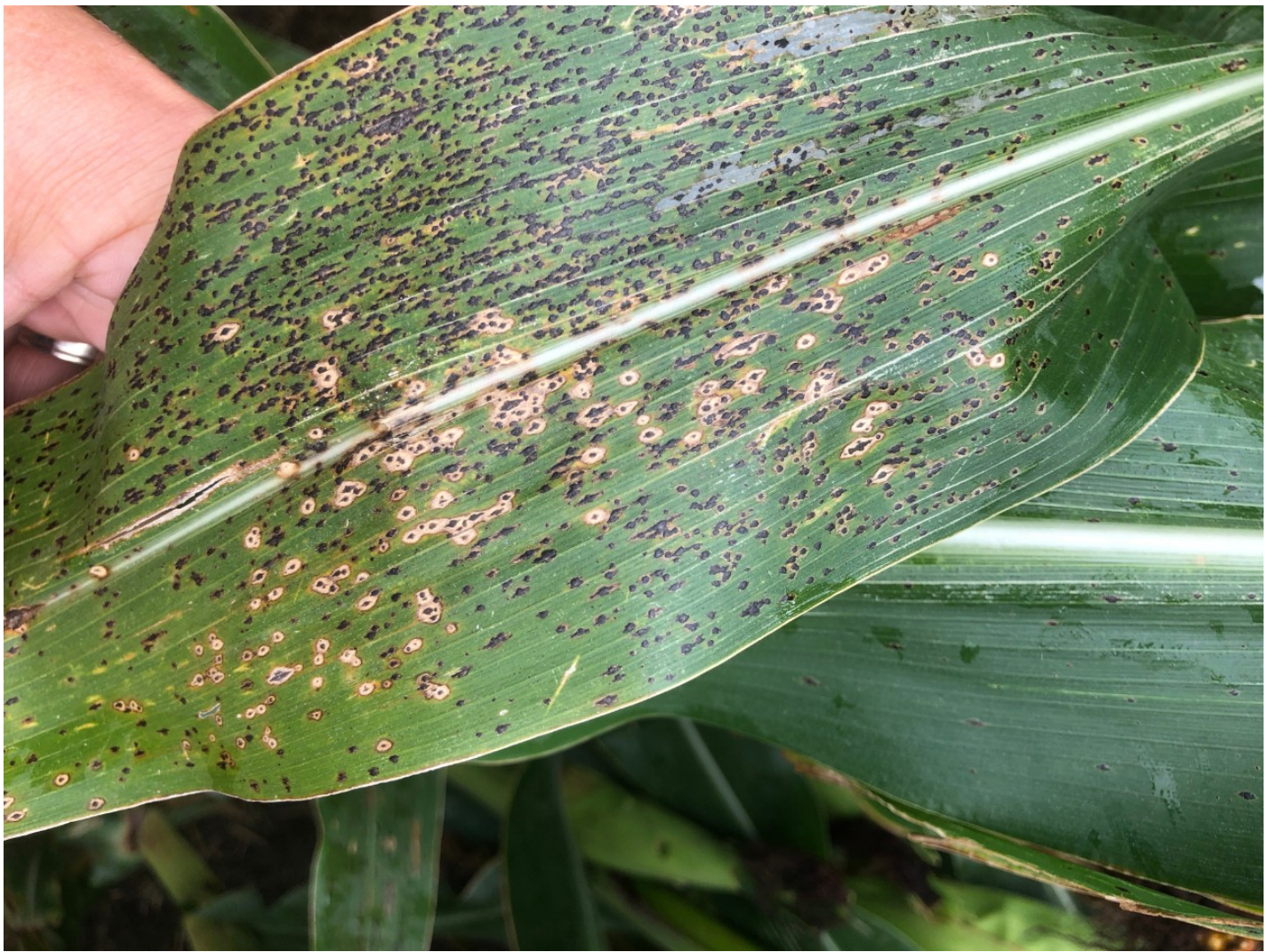
Figure 2. Black spore producing ascomata creating distinctive tar spot symptoms.

Infection and disease development are favored by cool, humid conditions with extended periods of leaf wetness. Although tar spot is new to the U.S., it is common in Mexico and Latin America. P. maydis is an obligate pathogen and requires a living host to grow and reproduce and is not known to be seedborne. Wind-driven rain can aid in spreading the disease.